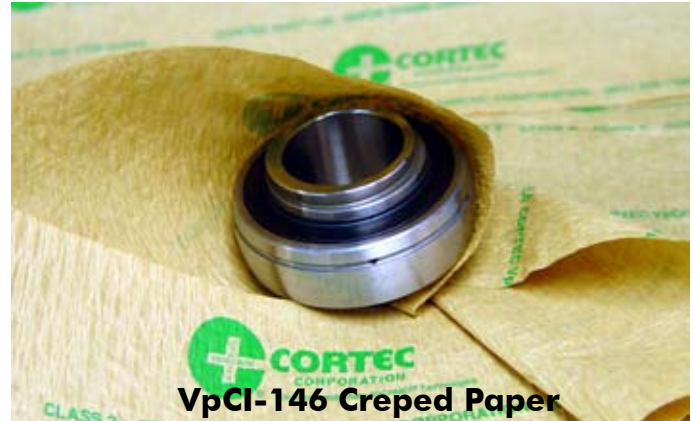
VpCI-146 Creped Paper

Cortec® VpCI-146 paper is made from the highest quality neutral natural kraft paper: our paper is made without the use of chlorine or other chemical bleaching. This eliminates package contamination found with other competing VCI/VPI papers. VpCI-146 is easy to use. There are no chemical concentrations to calculate, no chemical tanks or application system to maintain. Just wrap your products in the paper, and fold edges together. Use adhesive tape as needed to hold paper folds in place. The VpCI coating on the paper vaporizes, reaching all metal surfaces to provide complete corrosion protection. The unique inhibiting action of Cortec VpCI forms a very thin and very effective protective layer that does not alter the appearance of products or require removal before further finishing or use. Parts protected with VpCI-146 can be painted, welded, and soldered. VpCI-146 protective layer does not influence physical properties of most sensitive electrical components, including conductivity and resistance.