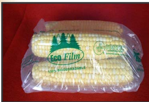
Eco Film Ready for Freezer Storage