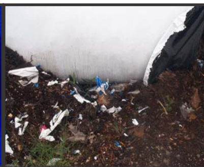
Plastic Contaminating Compost